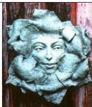
Gaia, by Earthborn Designs Lightweight Garden Sculptures

Perlite concrete, while not usually suited for structural or load bearing uses, offers many advantages beyond its lightweight. Perlite concrete provides sound deadening properties and is thermal insulating as well, depending on mix design. Generally speaking, the lighter the weight, the greater the insulative properties.