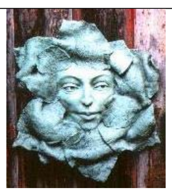
Gaia, by Earthborn Designs Lightweight Garden Sculptures

Perlite concrete, while not usually suited for structural or load bearing uses, offers many advantages beyond its lightweight. Perlite concrete provides sound deadening properties and is thermal insulating as well, depending on mix design. Generally speaking, the lighter the weight, the greater the insulative properties.